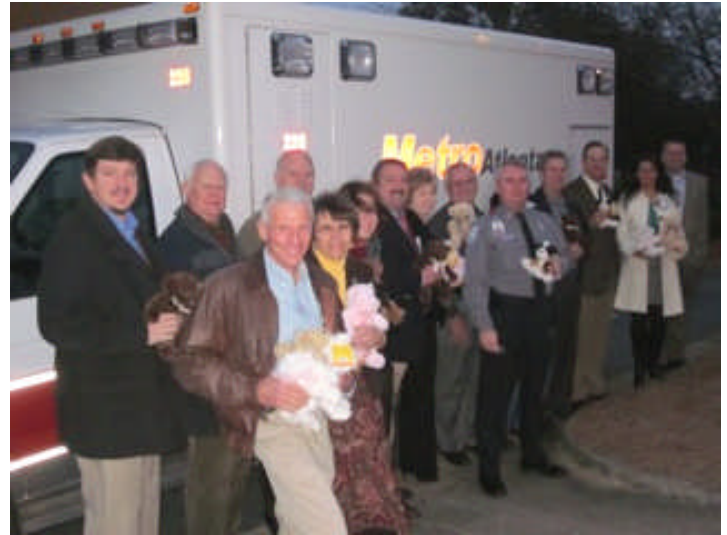
Metro Atlanta Ambulance brought an ambulance and several key area personal to the meeting and they graciously posed for a picture with club members and were recognized for the service to the community.

The program is very popular and especially helpful during emergency situations – either on pediatric calls or when young children happen to be around. Since the